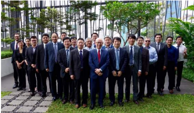
Members of the AHCC08 study during the Investigators Meeting held in Singapore on 27 August 2016.