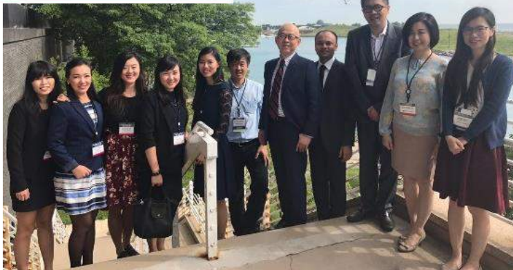
AHCC06 study team members and collaborators at the ASCO Annual Meeting in Chicago.