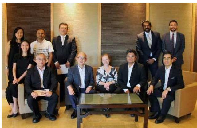
A group picture of the Steering Committee Members with the study team members after the meeting on 16 July 2017.

The steering committee met for the first time on 16 July 2017. The committee will provide scientific oversight for the registry. It will also be responsible for the direct scientific analyses which will lead to scientific publications. The study team is also working a research plan to leverage on the registry.