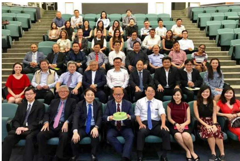
Picture of Investigators from the AHCC Trials Group taken during the 10 th AHCC Trials Group General Meeting on 13 July 2017.

The AHCC Trials Group looks forward to the next SLCC Symposium and General Meeting in mid of 2018. Meanwhile, the Trials Group will work towards more collaborations with research institutions and industrial partners.