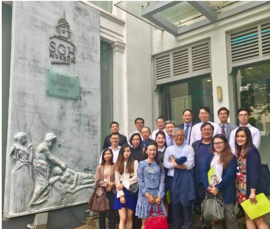
The Investigators took a tour at the SGH museum during the lunch break after the 1 st SLCC Symposium on