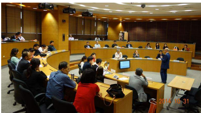
6th AHCC Trials Group General Meeting

We welcome UMMC and NCKUH to the AHCC06 trial and thank the sites for their hard work and support.