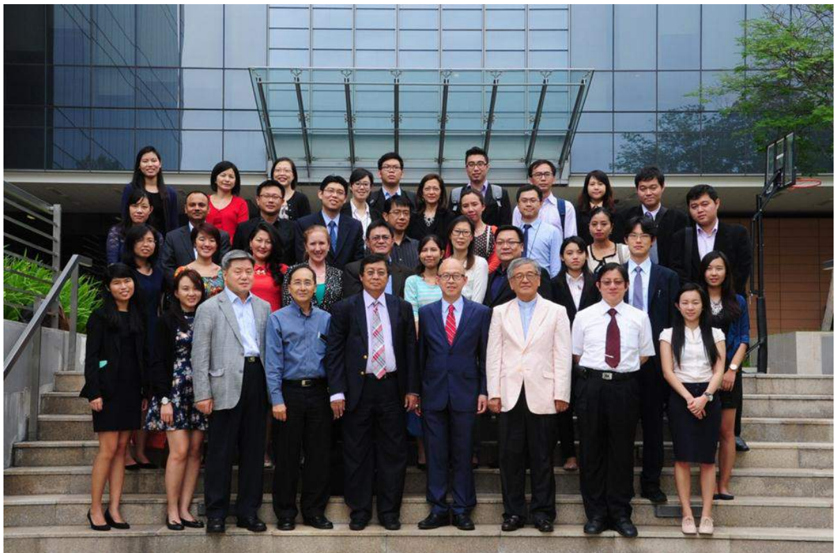
6th AHCC Trials Group General Meeting held at Duke-NUS Graduate Medical School.

Overall, the first AHCC Trials Group Scientific Forum and General Meeting was a stimulating learning and sharing experience for scientific and clinical participants alike. The study team would like to thank the Investigators, AHCC Trials Group Members, distinguished speakers and sponsors for making this event a success.