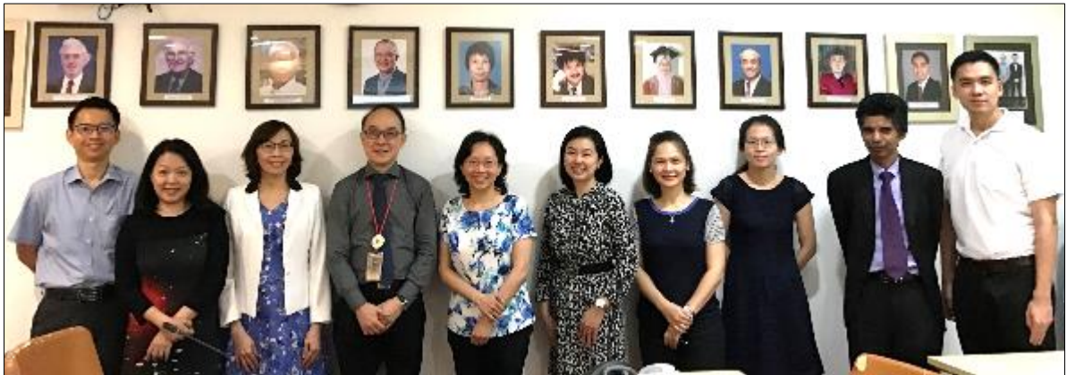
Asian PIBD Research Network 2 nd group meeting in University Malaya Medical Centre, Kuala Lumpur, Malaysia

The Asian PIBD Research Network held their 2 nd annual meeting on 4 th May 2018 at the Department of Paediatrics, University Malaya Medical Centre, Kuala Lumpur, Malaysia.