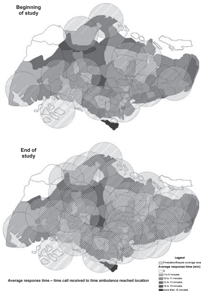
Figure 1. Ambulance deployment strategy of the study.

(house, office, public place, shopping mall, school, etc.) was also recorded. EMS timings were automatically recorded by the computerized central dispatch system. All watches and timings were synchronized with the central dispatch clock at the beginning of each shift.