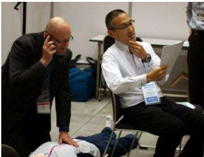
Practical training session: delivering CPR instructions to bystander over the phone