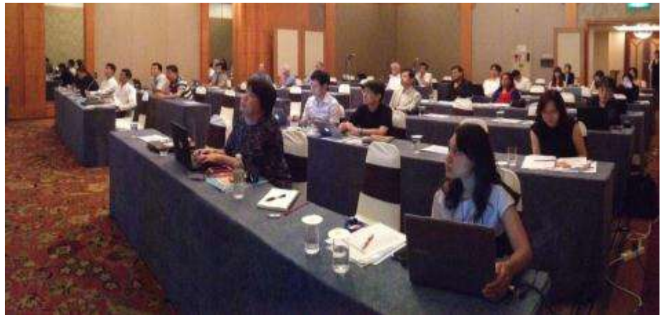
PAROS EXCO meeting at the Seoul Westin Garden Hotel