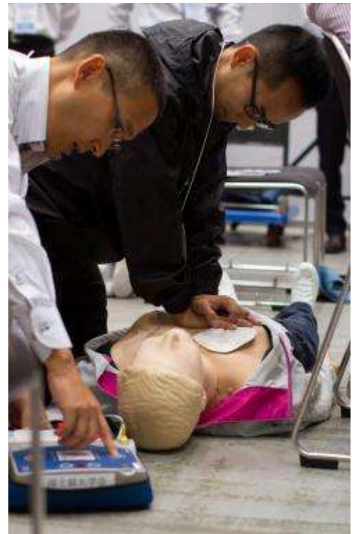
Practical training session: use of Public Access Defibrillator by bystander