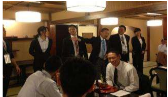
The Japanese organising team who made the events a success