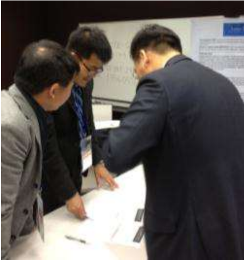
Asian EMS Council Poster Session: Judges deliberating over the winners