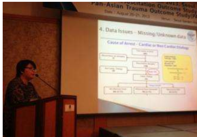
Ms Yap sharing the preliminary results of the PAROS database.