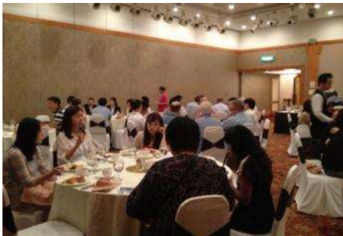
Buffet lunch at the Seoul Westin Garden Hotel