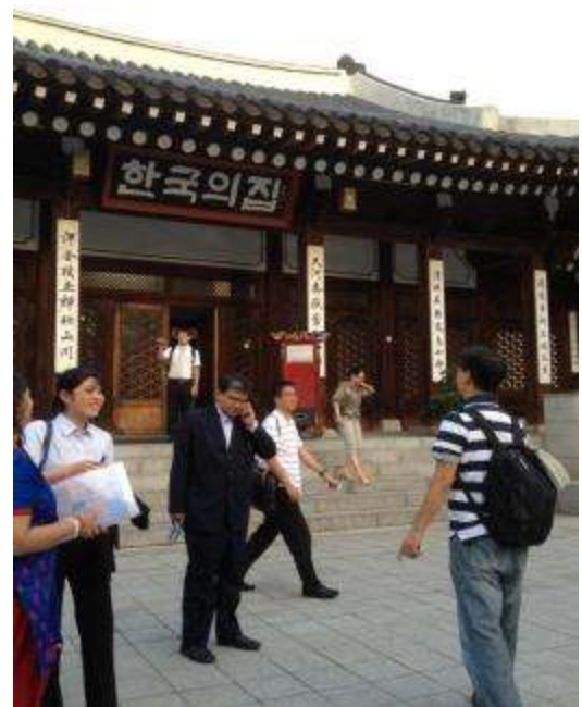
Dinner at a traditional Korean house.

A big thank you to the PAROS Korea team for their hospitality!