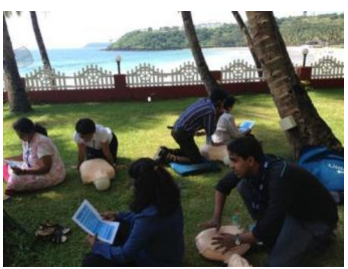
Hands-on Dispatcher CPR practice by the sea