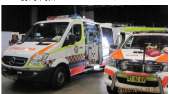
Community CPR day