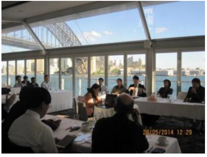
PAROS EXCO meeting with a lovely view of the Sydney Harbour Bridge