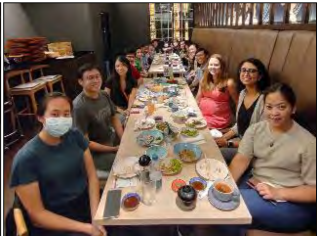
Dinner after the meeting