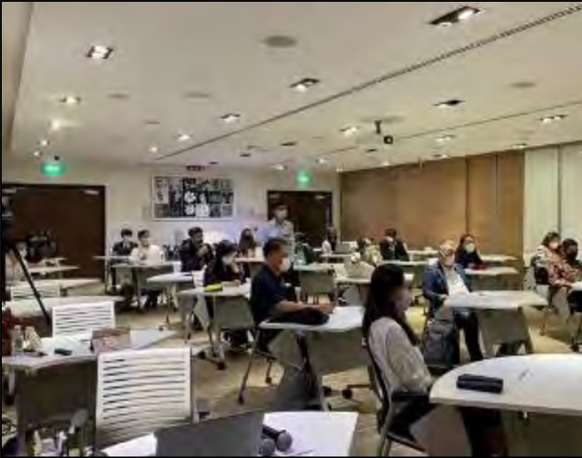
PAROS EXCO Meeting