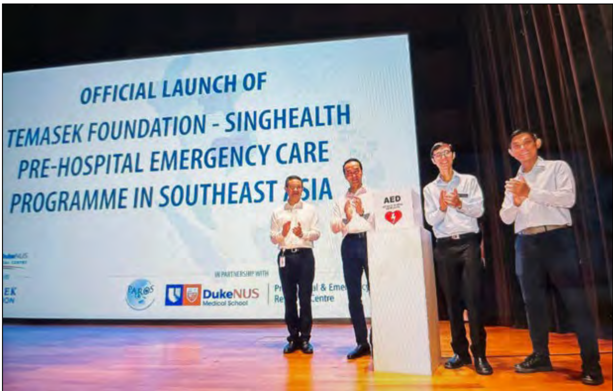
Launch of Temasek Foundation-SingHealth–Pan-Asian Resuscitation Outcomes Study Systems Improvement Program

The SIP comprised an EMS public forum (Hero with A Heart: Push A Button, Save A Life) in the morning and a seminar (Systems Improvement for Better Outcomes Among Out-of-hospital Cardiac Arrest Patients) in the afternoon. The day ended off with a closed door PAROS EXCO meeting.