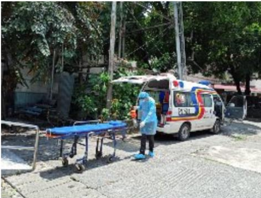
Cleaning of ambulance after use