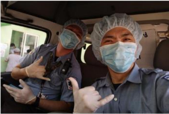
First response to possible Covid-19 patient. (January 27 2020). Photo taken while waiting for the patient to be admitted in a speciality hospital for infectious disease.