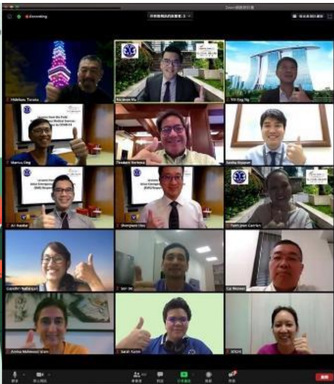
The program and speakers/facilitators

AAEMS through its Program and Advocacy committee will also conduct a survey on best practice in EMS in Asia as part of its follow-up to this activity. To close, participants were invited to EMS ASIA 2021 in Tokyo.