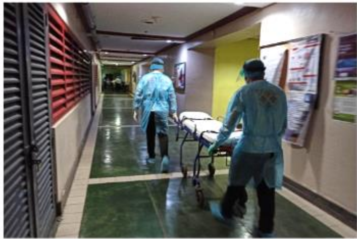
With Level 3 PPE suits.