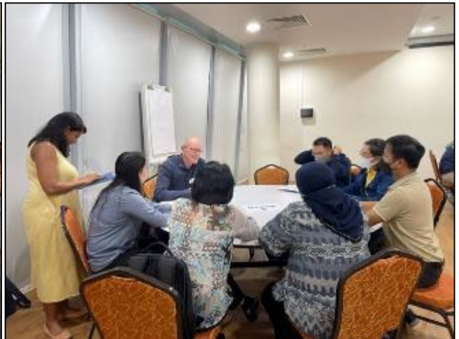
PECSET: Discussion, discussion and more discussion...