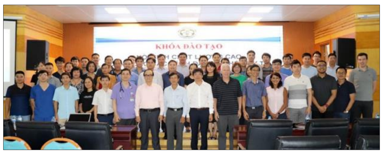
Trainers & participants

The 2-day course attended by ED doctors and EMS Center doctors aim to help improve cardiac arrest survival in their communities. The RA workshop is dynamic and engaging and includes didactic lectures, demonstrations, hands-on breakout sessions, etc. Faculty of the RA Workshop consist of both local and overseas experts.