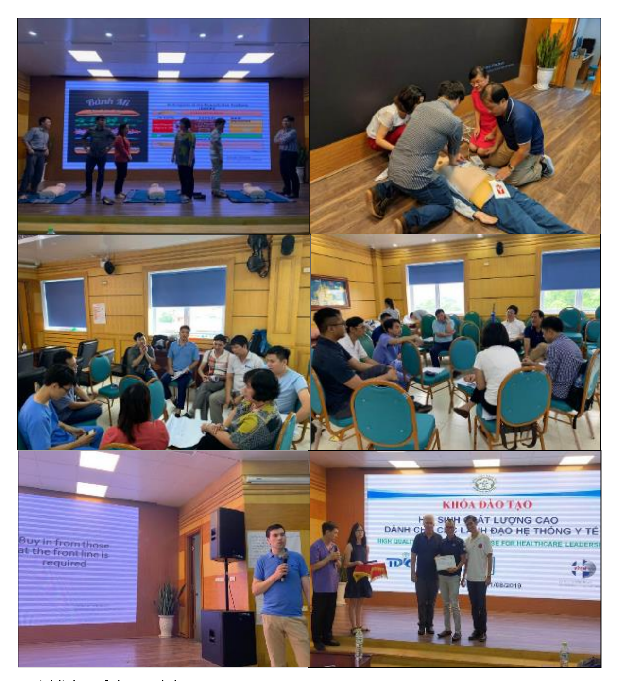
Highlights of the workshop