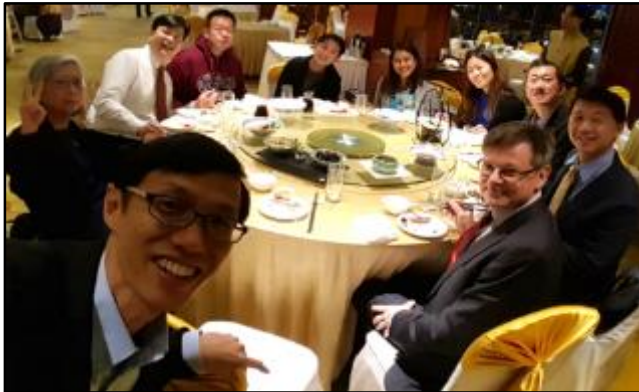
Appreciation dinner after the conference