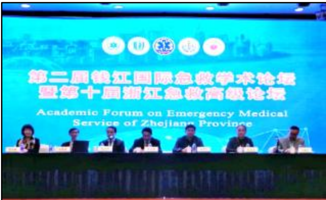
Opening of the 2nd Academic Forum on Emergency Medical Service of Zhejiang Province