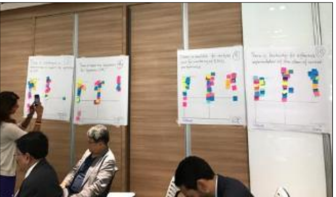
Consensus voting session