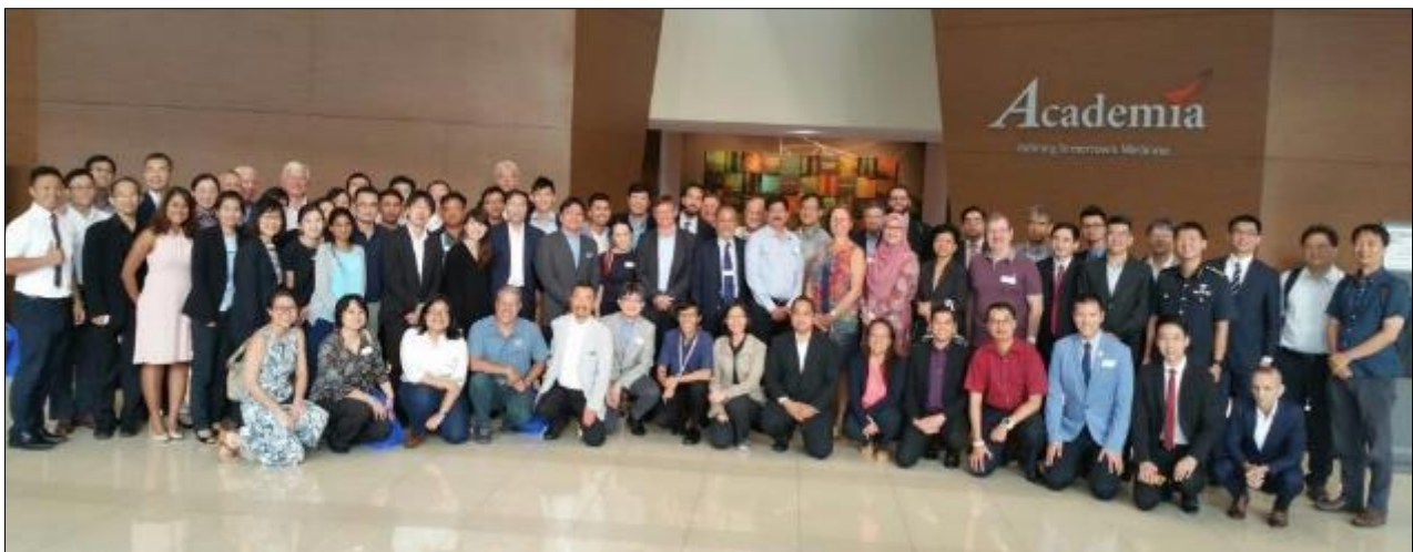
Participants of the Consensus Meeting, 1-2 Aug 2017, Academia, Singapore

A pre-meeting visit to the Singapore Civil Defence Force (SCDF) Headquarters was also arranged for the overseas experts to let them have a better understanding of our Singapore EMS system.