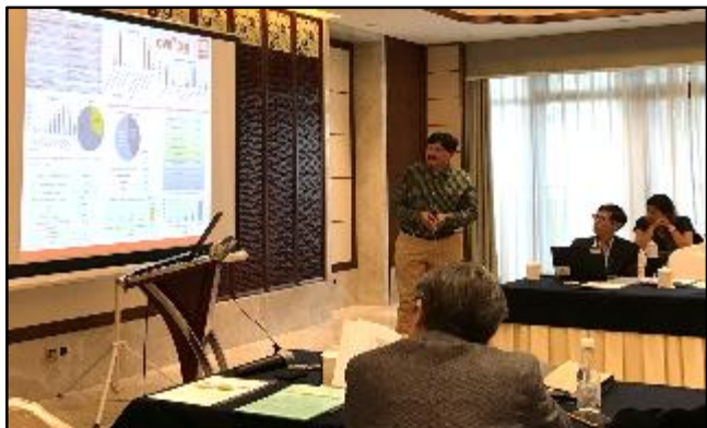
Progress of the RA 10-step program implementation in India by Dr Ramana Rao