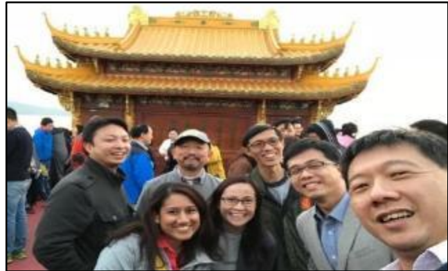
Westlake cruise to celebrate the success of the conference