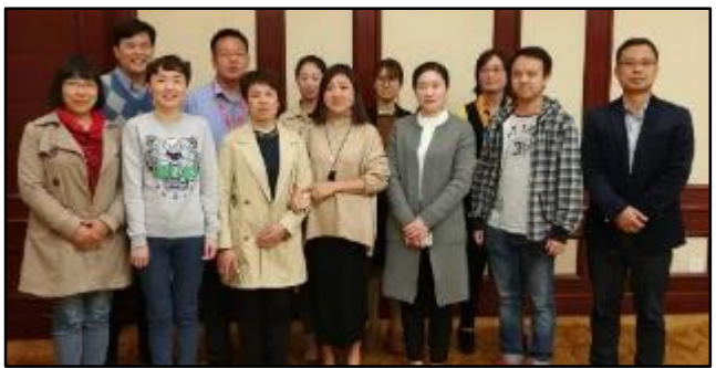
Dispatcher Assisted- CPR Workshop participants