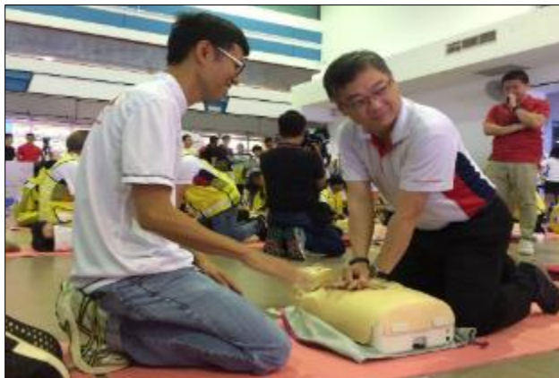
Singapore Health Minister Gan Kim Yong practising CPR using the CPRcard

About 4,000 CPRcards given out to participants of the Dispatcher-Assisted first REsponder training. The team targets to give out 15,000 CPRcards by Aug 2018. All 15,000 cardholders will be part of the world's first community trial that aims to evaluate if the devices have helped members of the public become more confident about rendering chest compressions and have led to good-quality CPR.