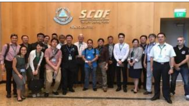
Pre-meeting SCDF visit on 31 July 2017