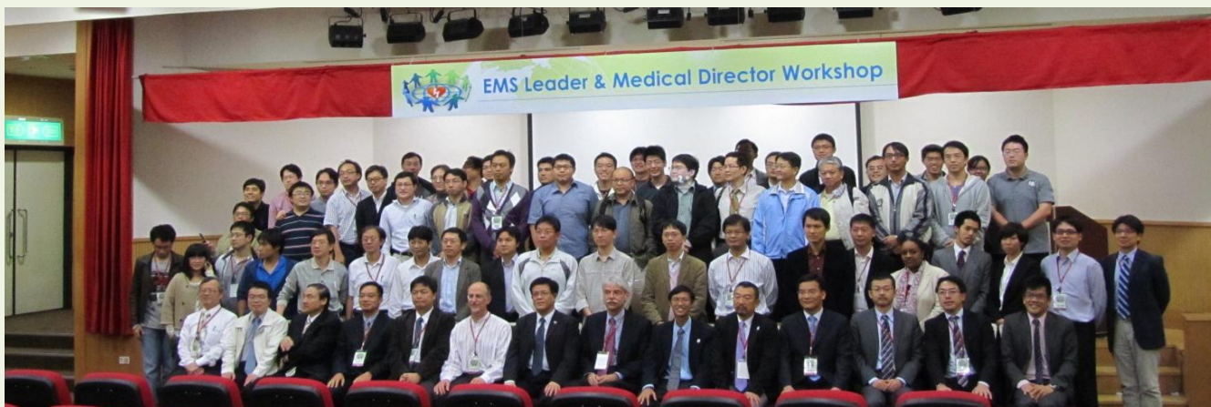
Top: Photo session at the EMS Leader and Medical Directors' Workshop in Taipei, 29-30 November 2011