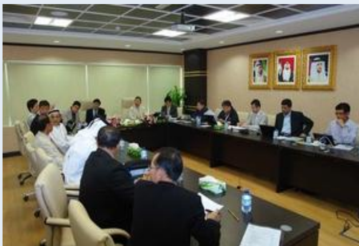
Left: PAROS EXCO meeting in Dubai, 17 April 2012.