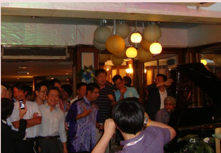
Left: Mass karaoke session during the PAROS dinner in Bangkok, Thailand, 4 July 2011.