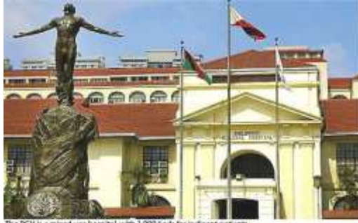
The PGH is a mixed-use hospital, with 1,000 beds for indigent patients.