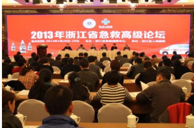
(Zhejiang Emergency Summit Forum of 2013)

About 300 delegates will attend the meeting