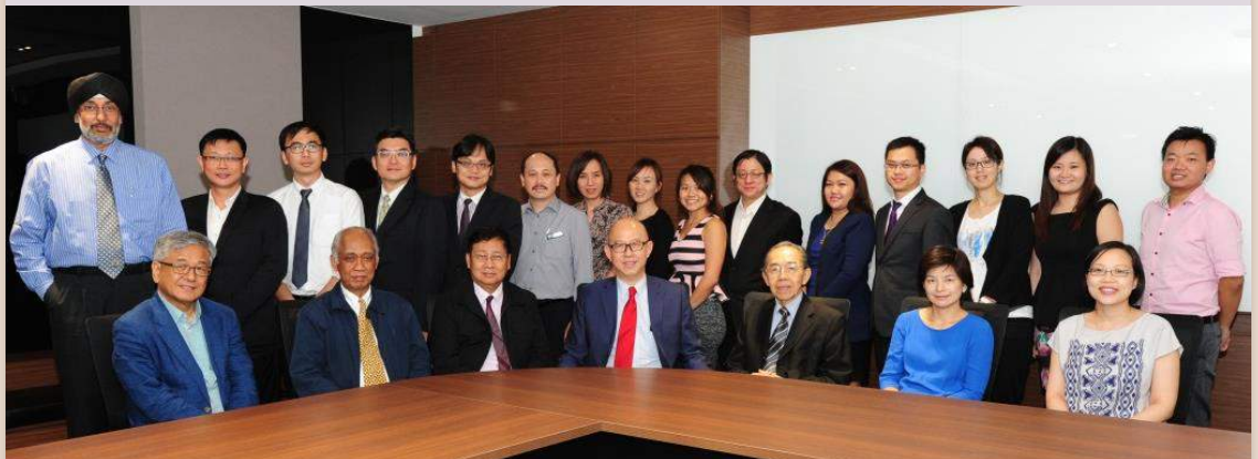
Group picture at the AHCC Trials Group General Meeting

As we are approaching the last quarter of 2015, the AHCC Trials Group is delighted to share that we have successfully held the 2 nd Scientific Forum and the 7 th General Meeting in May this year. Our ongoing AHCC06 SIRveNIB clinical trial has hit more than 90% of its target recruitment and the study team is working to complete recruitment by first quarter of 2016. The Trials Group is also in discussion with academia and pharmaceutical companies on new studies.