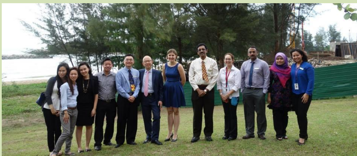
The study team from Singapore and Brunei posing in front of the future TBCC site.