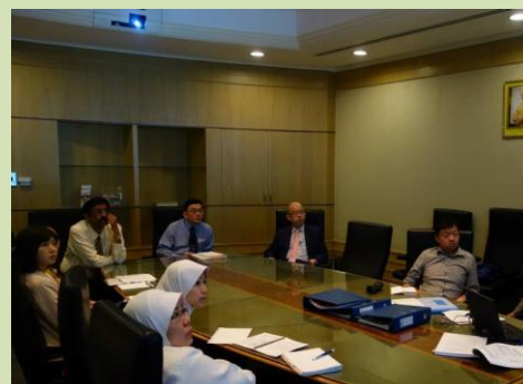
SIV at TBCC